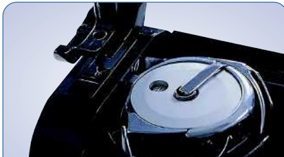
KM-390BL [With a Horizontal Large Hook]